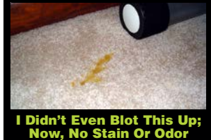
I Didn't Even Blot This Up; Now, No Stain Or Odor