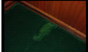
Won't Bleach Carpet Like Some Products Can