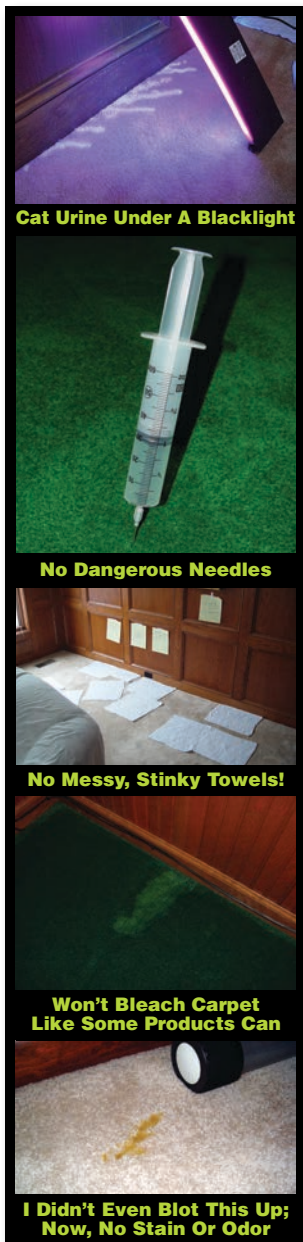
Cat Urine Under A Blacklight