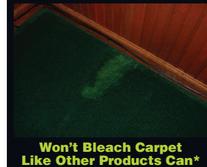
Won't Bleach Carpet Like Other Products Can*