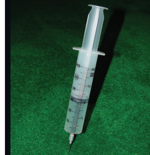
No Dangerous Needles