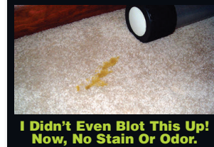
I Didn't Even Blot This Up! Now, No Stain Or Odor.