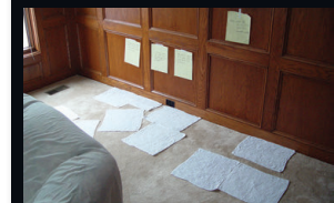
No Messy, Stinky Towels