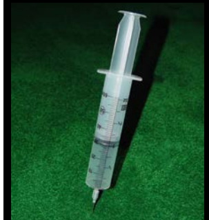
No Dangerous Needles