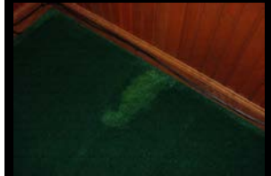
Won't Bleach Carpet Like Some Products Can