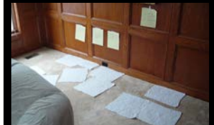
No Messy, Stinky Towels!