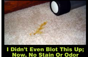
I Didn't Even Blot This Up; Now, No Stain Or Odor