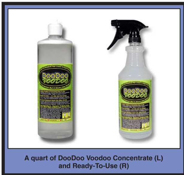
A quart of DooDoo Voodoo Concentrate (L) and Ready-To-Use (R)

Controls Stains & Odors From: Dogs · Cats · Ferrets · Foods Liquids · Feces · Blood · Cigarettes Decomposing Nuisance Animals & Other Organic Sources