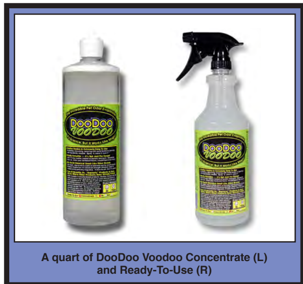
A quart of DooDoo Voodoo Concentrate (L) and Ready-To-Use (R)