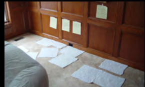
No Messy, Stinky Towels!