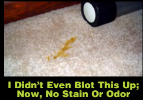
I Didn't Even Blot This Up; Now, No Stain Or Odor

Remember back in science class when you learned that matter is neither created nor destroyed, but just changes form? DooDoo Voodoo is a prime example of this well-known law of science. After it does its work, DooDoo Voodoo leaves behind just a temporary hint of its pleasant, natural citrus scent. Once the area dries, there's no residual fragrance...or odor.