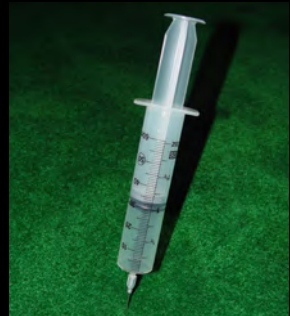
No Dangerous Needles