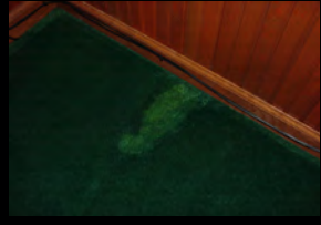
Won't Bleach Carpet Like Enzymes Can