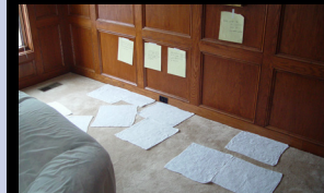
No Messy, Stinky Towels!