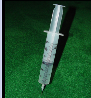
No Dangerous Needles