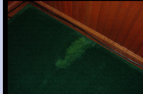
Won't Bleach Carpet Like Other Products Can*