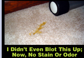
I Didn't Even Blot This Up; Now, No Stain Or Odor

then disintegrates & vaporizes the food source that the odor-causing bacteria eat. With no remaining food source, the bacteria die off rapidly, leaving no residual odor. Remember back in science class when you learned that matter is neither created nor destroyed, but just changes form? DooDoo Voodoo is a prime example of this well-known law of science. After it does its work, DooDoo Voodoo leaves behind just a temporary hint of its pleasant, natural citrus scent. Once the area dries, there's no residual fragrance...or odor.